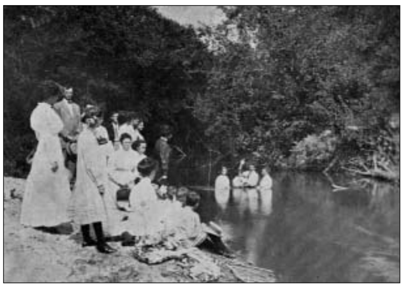
Baptismal photo of women from the Nazarene Rescue Home in Bethany, Oklahoma.