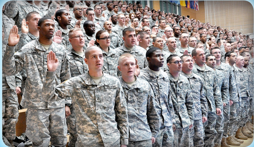
U.S. soldiers reaffirm their oath during the 5th Signal Command's Operation Solemn Promise commemoration event, Nov. 16, 2012, at the Wiesbaden Fitness Center, U.S. Army Garrison Wiesbaden, Germany.