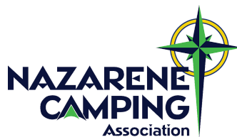
Nazarene Camping Association Annual Report