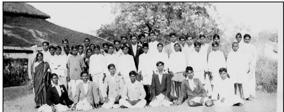
Nazarene Young Peoples Society, India, 1933