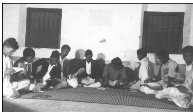
Bible School Students Studying in Basim, India