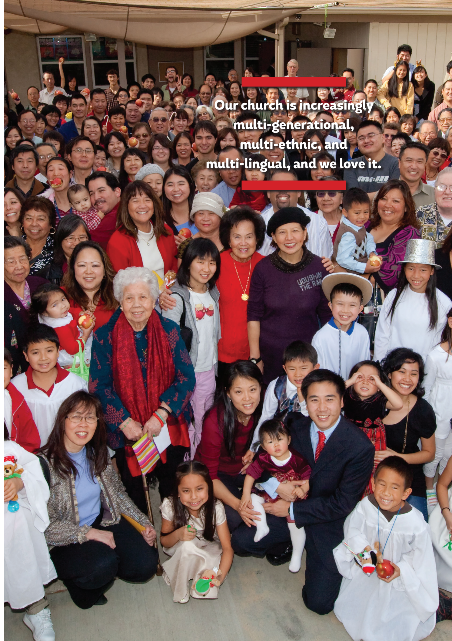
Right: The Trinity Church congregation today.

Our church is increasingly multi-generational, multi-ethnic, and multi-lingual, and we love it.