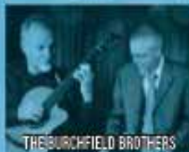
THE BIRCHFIELD BROTHERS