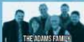
THE ADAMS FAMILY