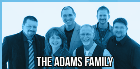
THE ADAMS FAMILY