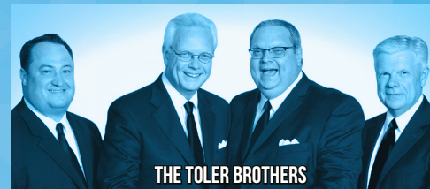
THE TOLER BROTHERS