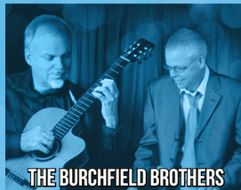
THE BURCHFIELD BROTHERS